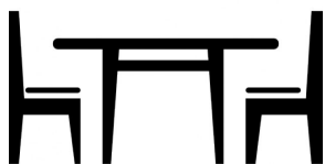
TABLES AND CHAIRS