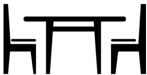
TABLES AND CHAIRS