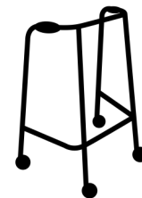
WALKERS & WHEELCHAIRS